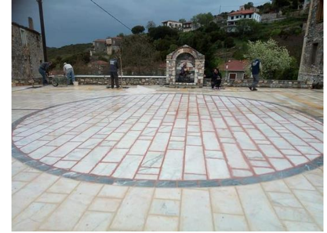
The placement of the marble surfaces on the terraces on either side of the fountain. In front the space for the panygiri.