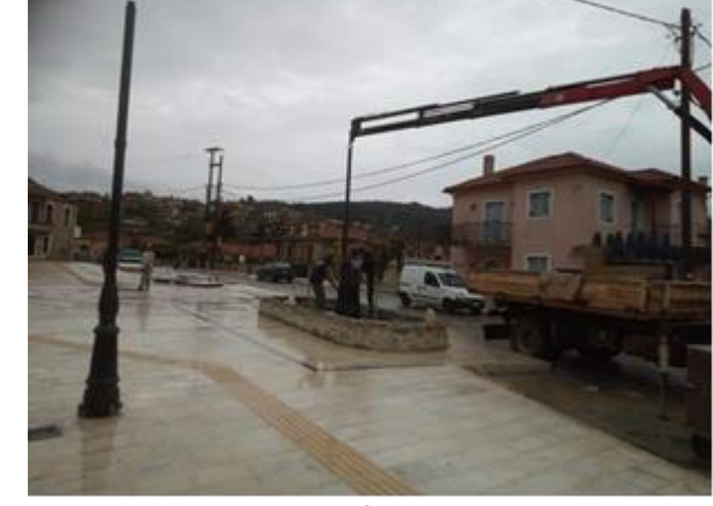
The placement of the lighting poles