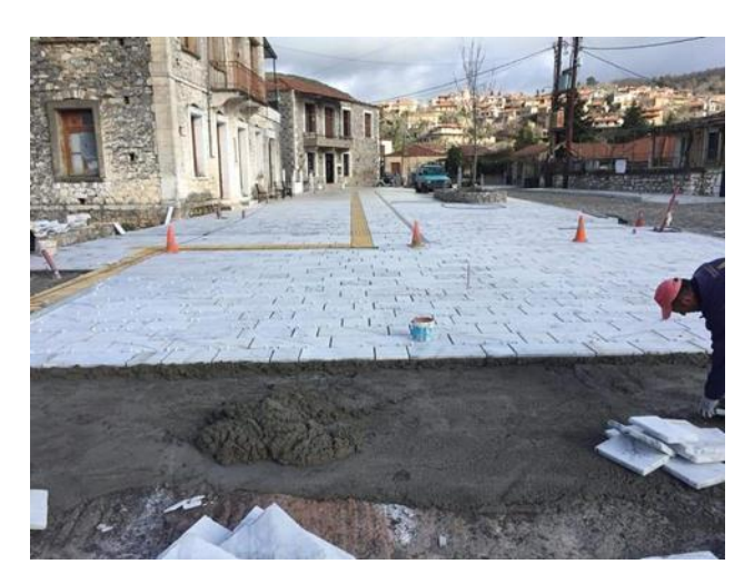
The completion of the pavement

We hope that the coffee shop and the tavern which operated at Rachi will take advantage of the new "platia" in order to create a second leisure space in Karyes.