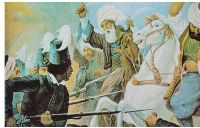
The battle in Dragatsani

However the Russians did not help the revolution and the Turkish army invaded. After the heroic final battle in Dragatsani, the two brothers managed to escape in Austria.